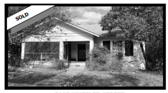
3105 WHEELER STREET Aldridge Place Historic District, Built 1926, 2BR, 1BA Listed at $750,000