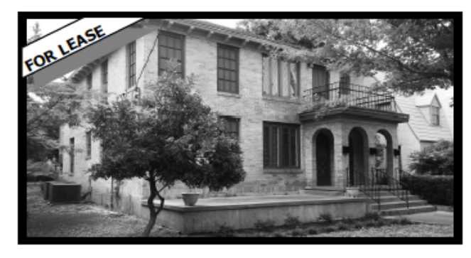
3306 HARRIS PARK AVENUE Charming upstairs unit with 2BR, 1BA, screened porch Available June 1st for $2,400/Mo.

Hyde Park, Hancock & North University neighborhood homes continue to be in high demand! Properties are selling quickly and at record high prices. Call your neighborhood expert today for a complimentary market analysis and customized marketing plan for your property. Check out new listings for sale on <a href="Instagram">Instagram</a> @hydeparkrealtor.