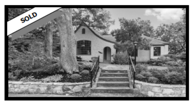
201 WEST 32ND STREET Storybook Tudor built in 1928, 4BR, 2BA Listed at $950,000