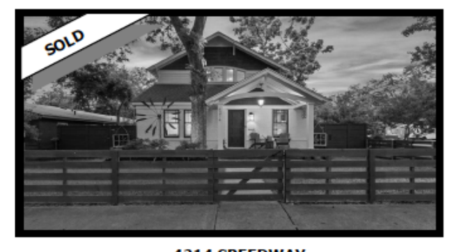
4214 SPEEDWAY Beautiful renovation of 1939 bungalow, 3BR, 3BA Listed at $1,195,000