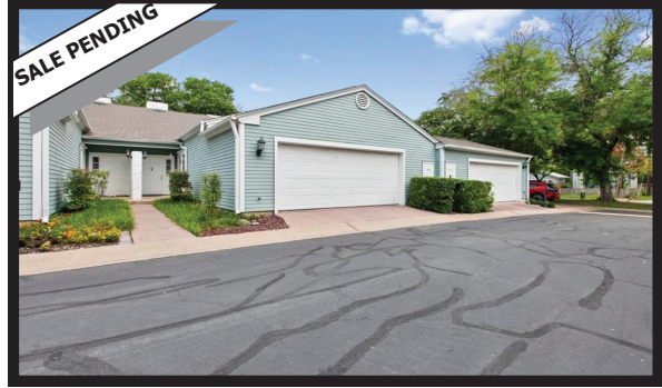
429 TOWNE PARK TRAIL

The Parlin House, a City of Austin Historic Landmark property built in 1922. 3,260 SF with 4 BR, 3 LIV, 2 DIN, oversized yard with pool & spa, patio, courtyard. List price: $2,450,000