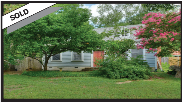
3006 HEMPHILL PARK

Recent updates– granite countertops in kitchen & baths, new appliances, carpet & interior paint. One-story townhome, 2 BR, 2 BA, 2-car garage. Community pool. List price: $699,000