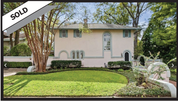
105 WEST 33RD STREET

The Parlin House, a City of Austin Historic Landmark property built in 1922. 3,260 SF with 4 BR, 3 LIV, 2 DIN, oversized yard with pool & spa, patio, courtyard. List price: $2,450,000