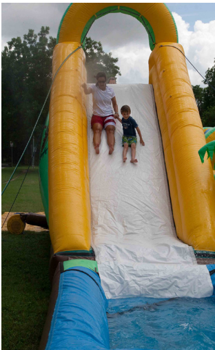
The giant waterslide.

Our 8th Annual 4th of July Parade and Carnival saw its largest turnout to date. Bikers, strollers, walkers and pets turned out in force to celebrate our nation's birthday. Our own Fire Station #3 led the parade with a red convertible (complete with its own Parade Queen and entourage) following right behind. Bringing up the rear, just about every mode of transportation made a showing. Everyone and everything seemed to be covered in red, white and blue. After a regal procession around Hemphill park, it was back to "the bench" for breakfast treats, drinks, carnival games and a giant water slide.