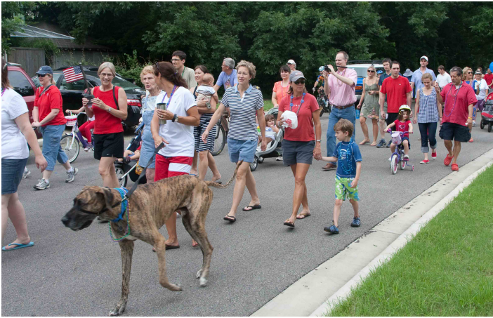
The whole neighborhood participated in the procession around Hemphill park.